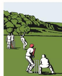
THE CRICKETERS SHROTON